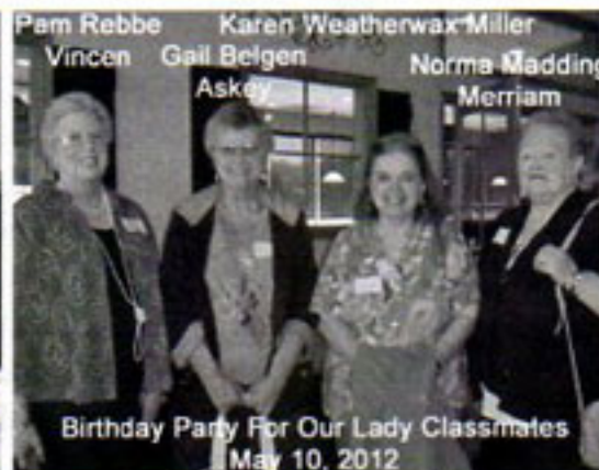
Birthday Party For Our Lady Classmates May 10, 2012

Party For Our Lady Classmates May 10, 2012