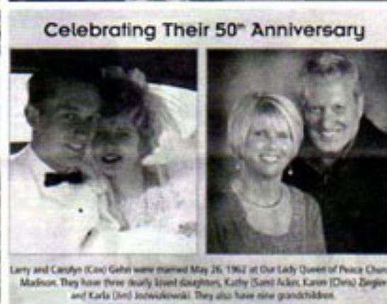
Celebrating Their 50 th Anniversary