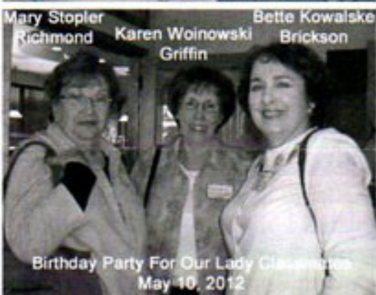
Birthday Party For Our Lady Classmates May 10, 2012