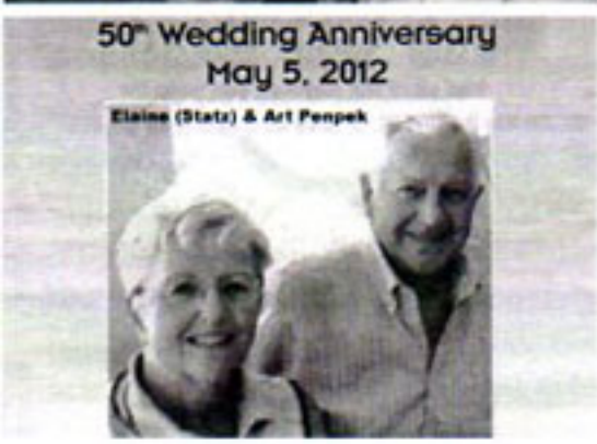
50 th Wedding Anniversary May 5, 2012