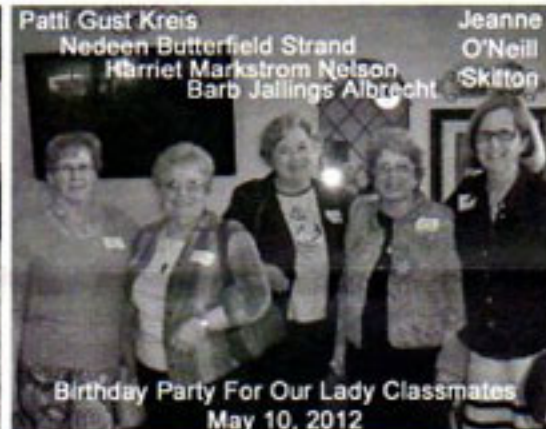
Birthday Party For Our Lady Classmates May 10, 2012